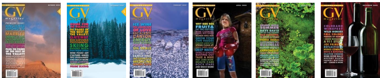
Grand Valley Magazine, Inc.